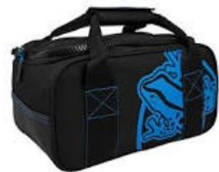
AKONA weight Bag