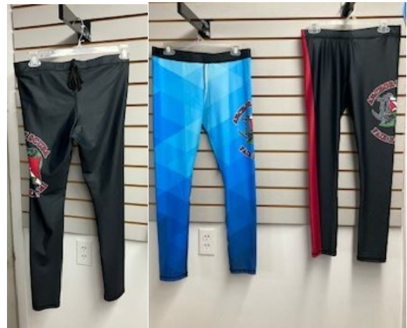
New ABS Logo Lycra pants for diving