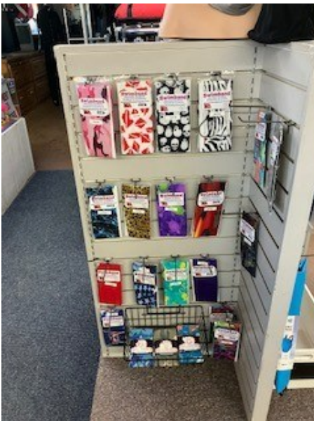
Dive Buddy Originals Dive Head Bands !